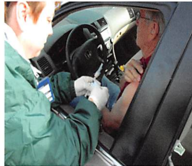
Immunization Team Drive Thru Flu Clinic