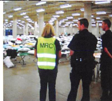
Special Needs Shelter Deployment